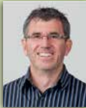
Pr Colin Renfrew General Secretary